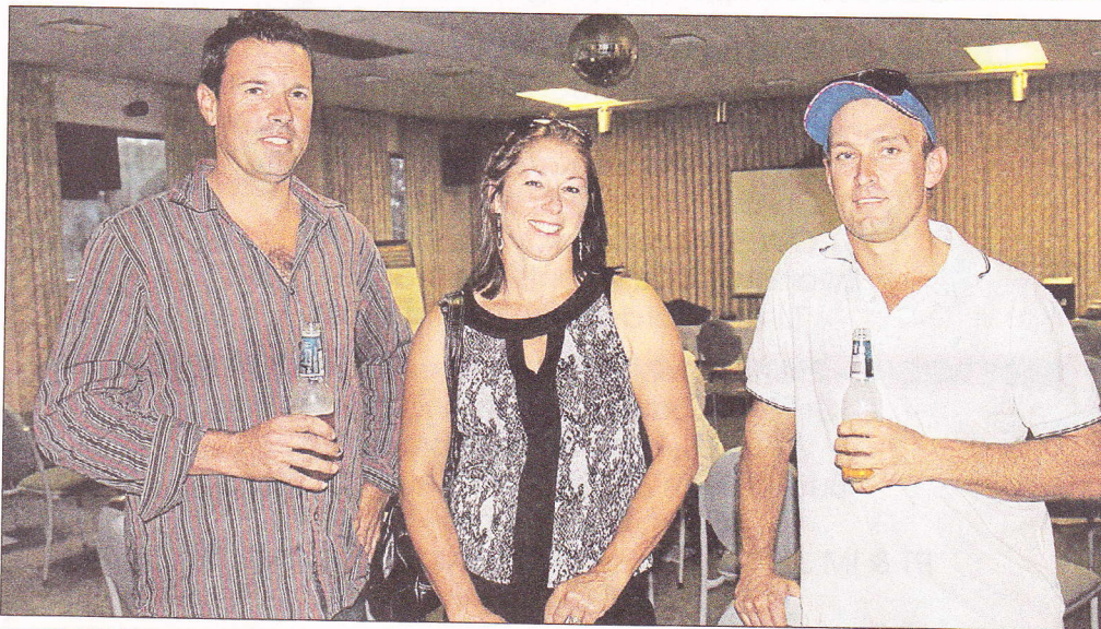
Continued from page 75

carcase weight of 20.47kg. The Orrs also picked up third place in the 300-plus lambs consignment category with a line of 335 purebred Prime SMMM lambs which averaged 26.45kg.